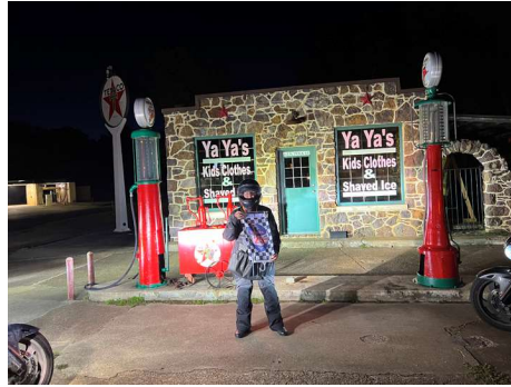
Pit Stop 2,025 Fuel Credits

I filled the gas tank up, then printed the receipt. My iPhone said 5:30. The receipt said 5:29. Darn! Again, I squeezed a few drops of gas in the tank for another receipt. This time it said 5:32. Yay! We're off!