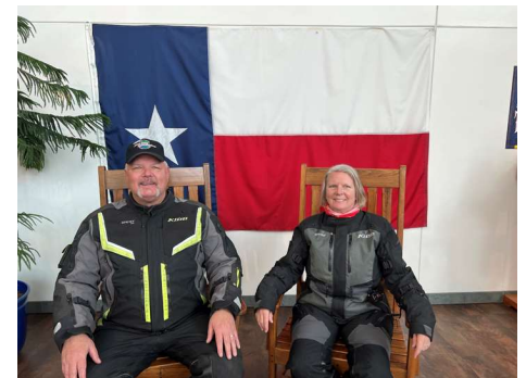
Texas Welcome Center

You were allowed to start anywhere in the state. Karen and I chose to start in Jefferson, TX. There was a huge pit stop worth 2,025 fuel credits. This would allow us to get up to 2,025 bonuses points before stopping again for more fuel credits. A big plus!