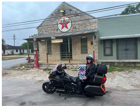
Driftwood Pit Stop

After 17 ½ hours of riding, we stopped for the night. We were up and back on the bike by 6:00 am getting our stop receipt! We had another big day of riding ahead of us!