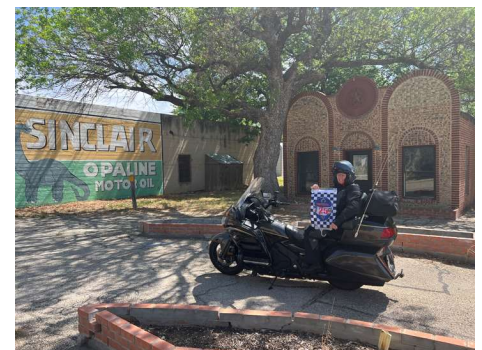
Menard Pit Stop

Every rally is different. For this rally, if you finished one minute late, you're out! DNF (Did Not Finish)! So, timing is everything! We decided to shed 7 locations on our route. This would cost us over 2,000 points. But, it would be better than a DNF!