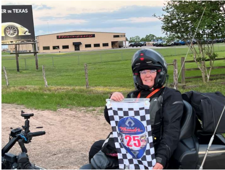
Hennessey Racing Building

Some bonuses were available 24-hours. A few had a daylight/hours restriction on them. One of our bonuses west of Houston had a “daylight only” restriction. Sunset was scheduled for 7:50 pm that day. We took a picture of the Hennessey Racing sign near Sealy right at 7:50! Whew! Just in time!