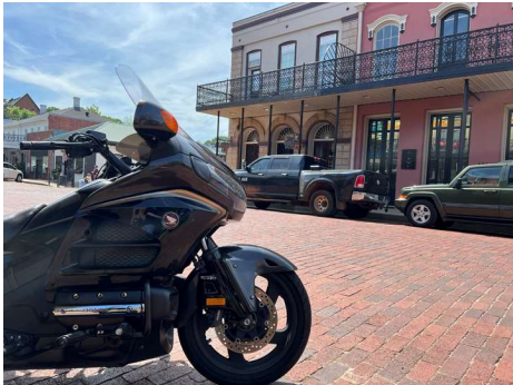
Kahn Hotel in Background

Karen and I walked around the town and visited several shops. Then, we hopped on the bike to scout out a gas station that would be open at 5:30 the next morning to start the rally. We also checked out our first pit stop to see where we would be riding to next.